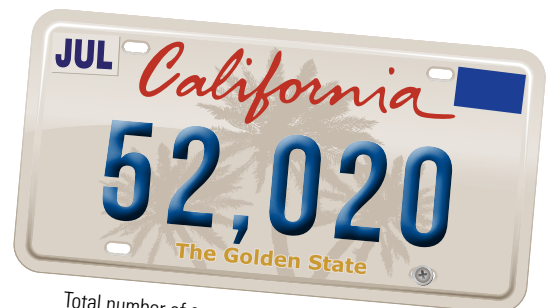
Total number of community associations in California

of CIDs in California are condominium-style developments and remain the most prominent.